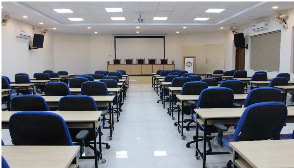
Capacity- 80 Persons