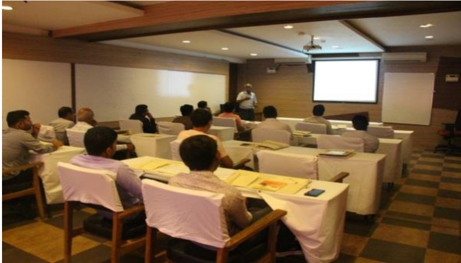
Capacity -30 Persons