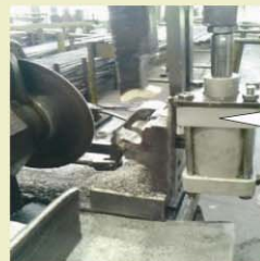
Vertical Pneumatic Cylinder for sufficient gripping for cut tubes